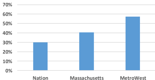
Bachelors Degree or Higher

The 495/MetroWest region has a very well educated workforce with 57.3% of the population in possession of a bachelor's degree or higher. According to the U.S. Census Bureau, 40.5% of the Commonwealth's residents hold a bachelor's degree or higher for the same time frame and age group. Both Massachusetts and the 495/MetroWest region have higher levels of educational attainment than the nation-at-large at 29.8%.